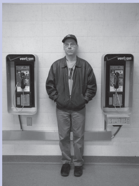
Paul Oehlers' two new films have been selected as finalists at IndieFests.