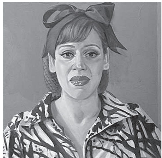
“Chickory,” oil on linen, 2003