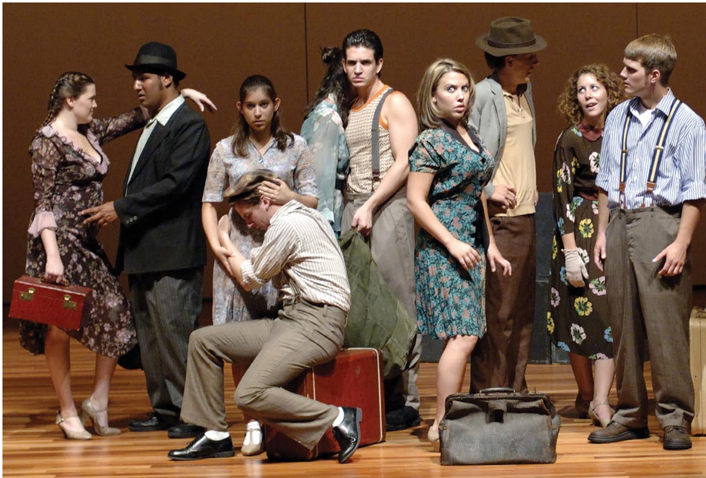
Cast of They Shoot Horses, Don't They?

In December, a month after the last curtain call for their production of They Shoot Horses, Don't They? , the cast of 18 students from American University's Department of Performing Arts took their show on the road—all the way to Yaroslavl, Russia, to participate in the Seventh International Theatre Festival. It was not only the first AU theatre production to tour outside the Washington, D.C., area but it was also the first time a U.S. university had participated in the festival, which takes place at the historic Volkov Theatre.