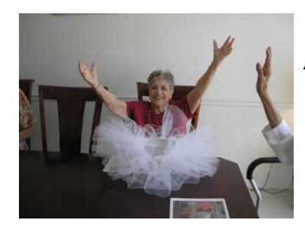
A participant in an Art/Engage program on Degas shows her expressive side.

Art/Engage works primarily with senior citizens, but the organization has a long-term goal to expand services to residential treatment programs for adults and children with disabilities, hospice homes, adult community centers, and facilities that offer after-school programs. In addition to its founders, Art/Engage currently has a handful of volunteers—including a few AU art history alums—and would love to expand. If you would like to learn more about the organization or volunteer opportunities, please visit the website at <a href="https://www.artengage.org">www.artengage.org</a>.